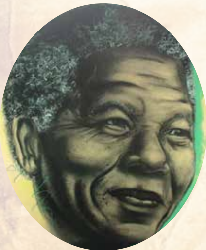
Nelson Mandela 1918 - 2013. South Africa

“ We will show that after all the black man is capable of handling their own affairs. We will demonstrate to the world, the other nations and the young people that we are ready to drive our destiny.”