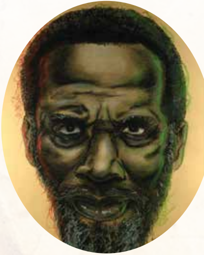
Jomo Kenyatta 1893 - 1978. Kenya

“ When the whites came, we had the land. They brought the Bible and taught us to pray with our eyes shut. When we opened them, they had the land and us the Bible.”