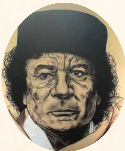
Muammar Gaddafi 1942 - 2011. Libya

“ The battle ahead is critical, it is aimed at the expulsion of imperialism from Africa (...) decolonization is not simple geographical transfer of the centre of decision making... It is to dismantle the political, administrative, and cultural systems...”