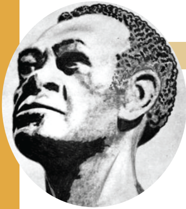
José Leonardo Chirino

José Leonardo Chirino (1754-1796), only son of a free Indian and black slave belonging to a Creole family, led distinct insurrections to abolish slavery thus generating a series of disturbances in the colonial order in Venezuela.