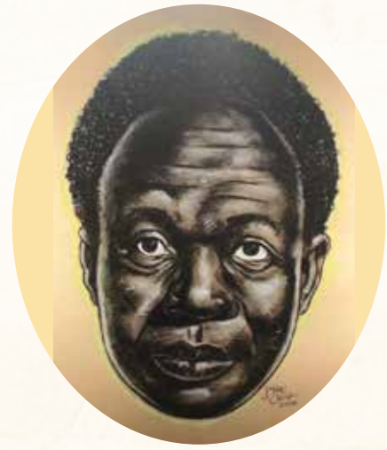
Kwame Nkrumah 1909 - 1972. Ghana

“ When the whites came, we had the land. They brought the Bible and taught us to pray with our eyes shut. When we opened them, they had the land and us the Bible.”