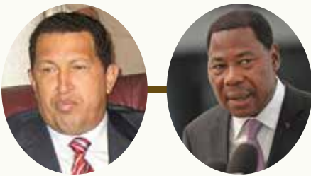
Guest book Embassy of Venezuela in Benin, 2006.

“Here's Venezuela sister homeland Benin. The Venezuelan people are here . Bolívar is here. God Bless our Embassy, as the house of friendship and unity.”