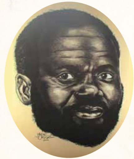
Samora Machel 1933 - 1986. Mozambique

“ Our basic demands are as a result of recognizing that people and nations of the South have equal rights in the world, access to a fair share of the world's resources, so that we can be self-sufficient in the future, and for a just pay for a fair day's work. ”