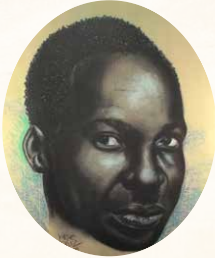
Julius Nyerere 1922 - 1999. Tanzania

“ Our basic demands are as a result of recognizing that people and nations of the South have equal rights in the world, access to a fair share of the world's resources, so that we can be self-sufficient in the future, and for a just pay for a fair day's work. ”