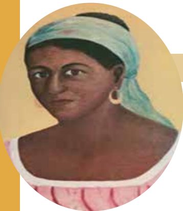
Juana Ramírez "La Avanzadora"

Pedro Camejo (1790-1821) better known as " Negro Primero (First Black) ", was the only official of African descent in the army of Simón Bolívar who fought in the war of independence of Venezuela.